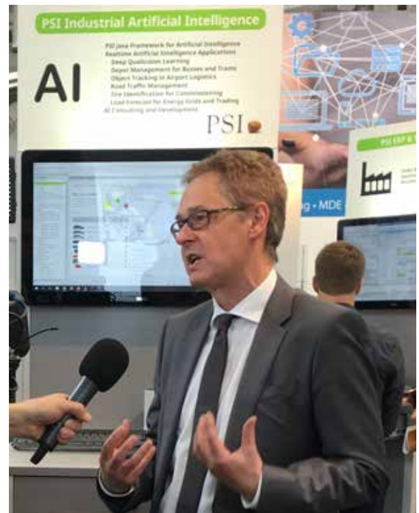
Interview with Dr. Rudolf Felix.

before the AI learning process takes place. Thus it can be used by a suitable AI learning method for creating a model of that data in order to automatically detect similar data patterns